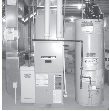
The flood alarm is attached to the cold air return on the left.

Because the furnace and water heater are so critical, the photo shows the